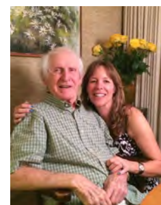
Me & my father