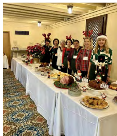
Hospitality Team for Dec.