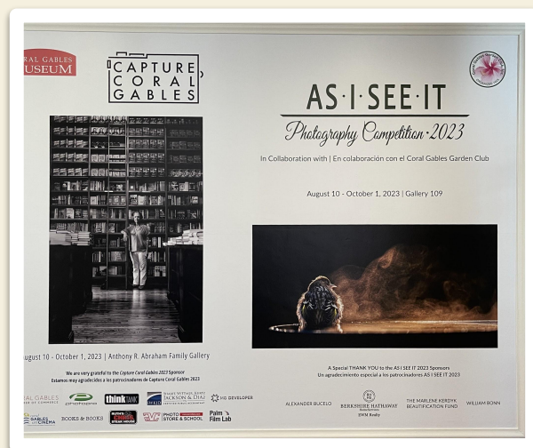
Photography Preview at the Coral Gables Museum