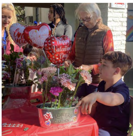
Members of the Coral Gables Garden Club.