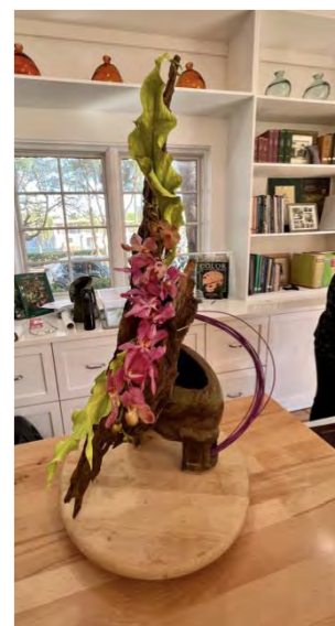
Striking floral design by Mayfair Hydro