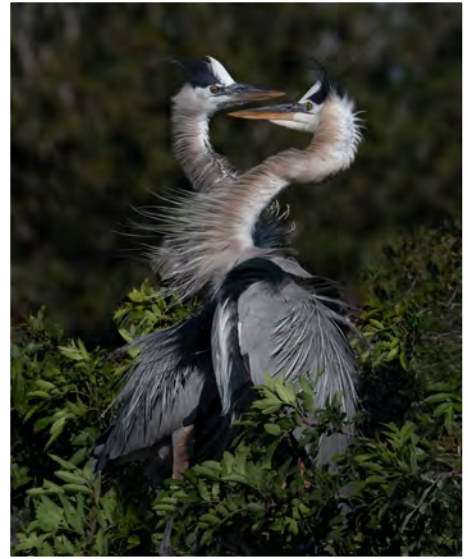
From the As I see it photo competition. Love by Susan Beausang