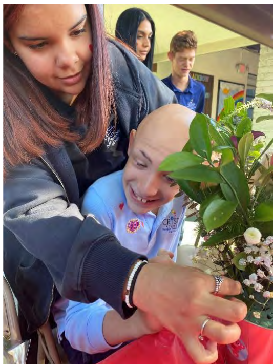
Children enjoying flowers