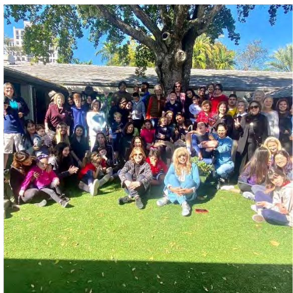
Crystal Academy students, staff and Garden Club members