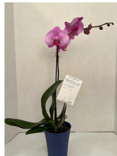
Phalaenopsis with card