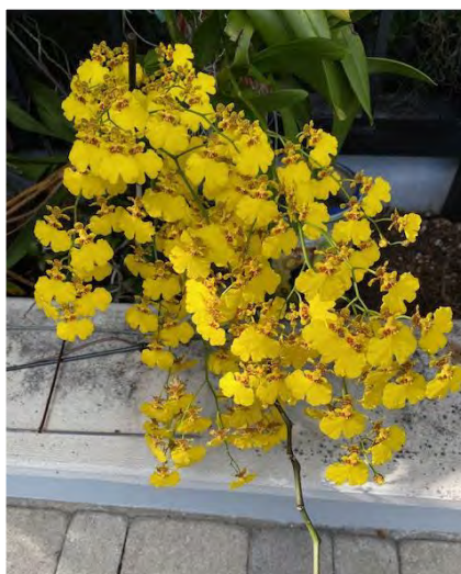
Oncidium Dancing Lady