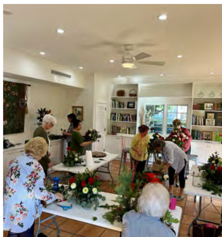
Ladies at work on their beautiful creations