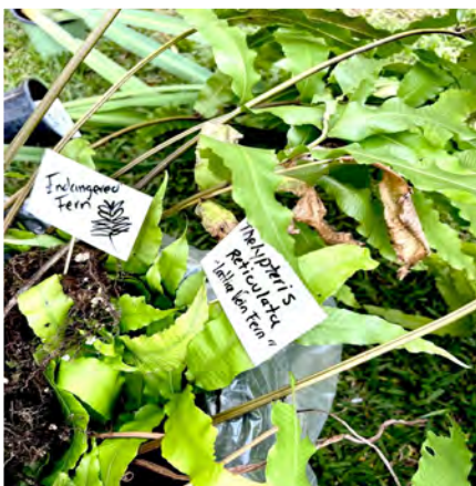
L. Endangered ferns donated by Fairchild. R. Heritage Garden at the Merrick House