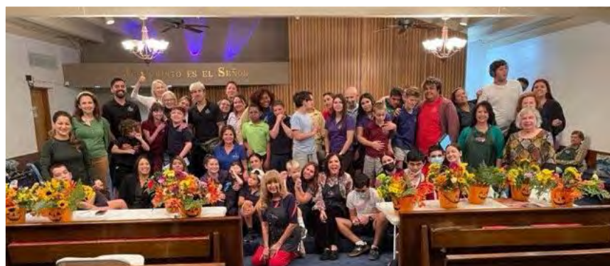
Garden Club members with students and staff at Crystal Academy