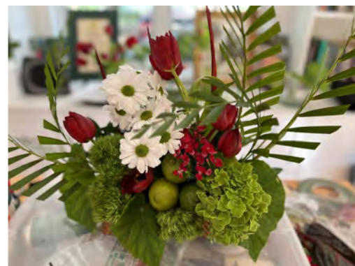
Crescent design arrangement