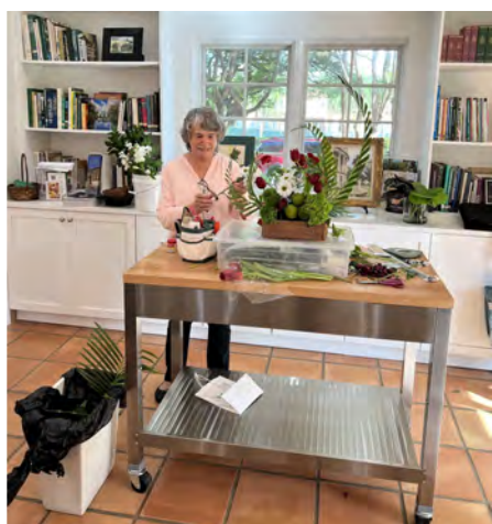
Sandy demonstrates crescent design