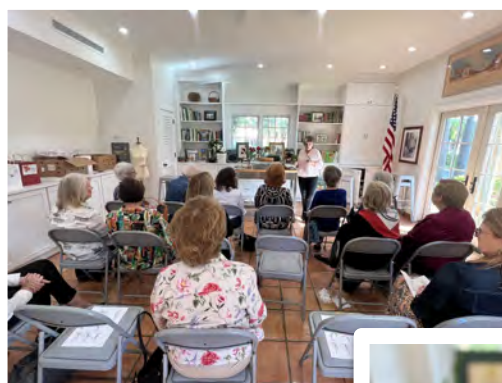
Packed house for the workshop