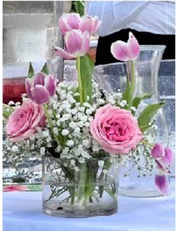
Above: A study in pink—Beautiful table decor at the May Installation Luncheon