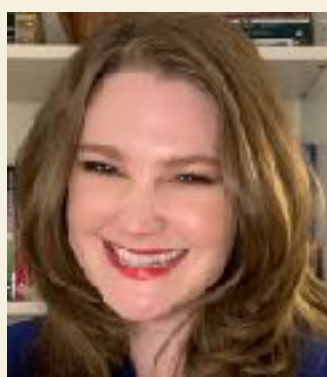
5. Emily de Armas