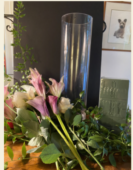
At right: What beautiful centerpiece can our Divas make from these? Just wait and see!

The Garden Club's Designing Divas are back! They are designing the centerpieces to be raffled at the spring Fashions & Florals event. You will be able to bid for any centerpiece, not just the one at your table. Purchase your tickets and place them in the small container next to the centerpiece you would like to bid on. This event is our major fundraiser of the year, so we hope you will enjoy a beautiful arrangement and support our Club.