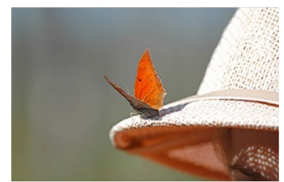
Everglades National Park

Caterpillars of the Leafwing only feed on pineland croton, a shrub that grows in the understory of a pine rockland habitat. This makes a good reason to join Fairchild’s “Connect to Protect” program, which seeks to increase the number of pine rockland plants in residents’ yards to provide a “bridge” for wildlife between the fragments of pine rockland that remain in Miami Dade. Sign up and help our endangered Leafwing!