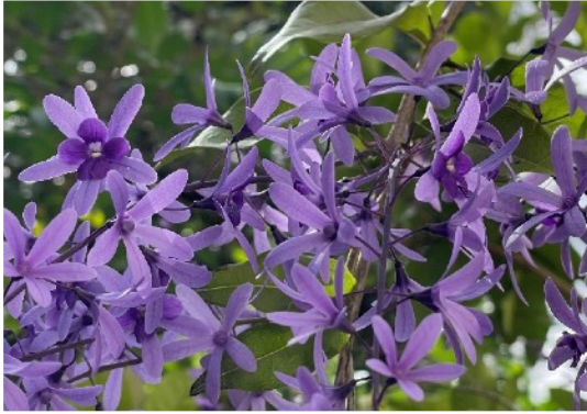
Queens Wreath Vine (Petrea volubilis)