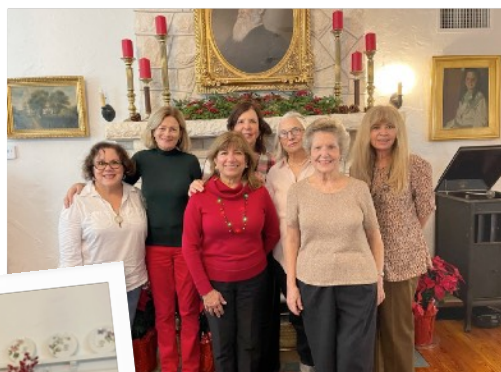
Finished decorations, Santa's elves and an appreciation letter from the City of Coral Gables for our efforts.