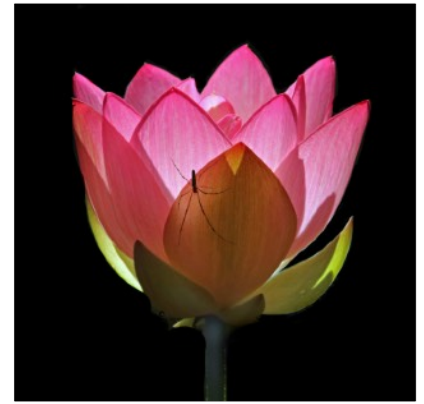
As I See It 2021 winning