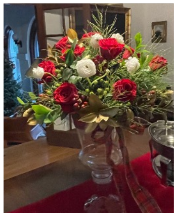
Above and below: Holiday designs

Get the new year off to a good start by changing the filters in your air-conditioning units—saving both energy and money on cooling costs! Plus, enjoy our lovely south Florida winter weather by turning off your air-conditioning and opening your windows to experience the cooler temperatures.