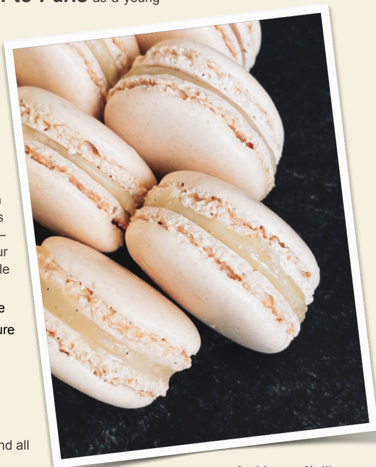
Les Macarons Vanille

It was the most fun you can imagine in a few hours time, learning the secrets to these classic French delectables with their crisp shells and cold creamy centers. We discovered that almond flour was part of the flavor secret; another flavor secret can be found in Chef Benoît's recipe on our website [ link goes here ]. We students laughingly found out that piping dough is harder than it looks but enormous fun, and that multi-tasking is a skill every pastry chef needs. Best of all, we each took home a box of our own creations to share with family and friends. If you are looking for holiday recipe inspiration, this is the place to be. Vive la France! — https://casabake.square.site/casa-bake-classes . PS — If you are interested in a private class for Garden Club members, please contact me at marci.montgomery@icloud.com .