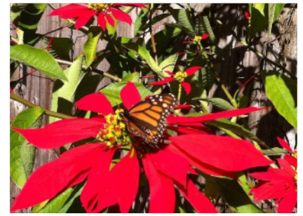
Monarch on a Poinsettia—See story on page 3