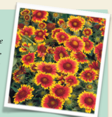
Gaillardia Blanket Flower