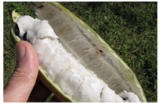
Inga or Ice-Cream Bean